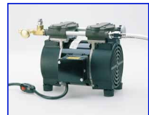
CS-PK2 VACUUM PUMP