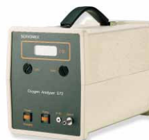
TR-104 OXYGEN ANALYZER